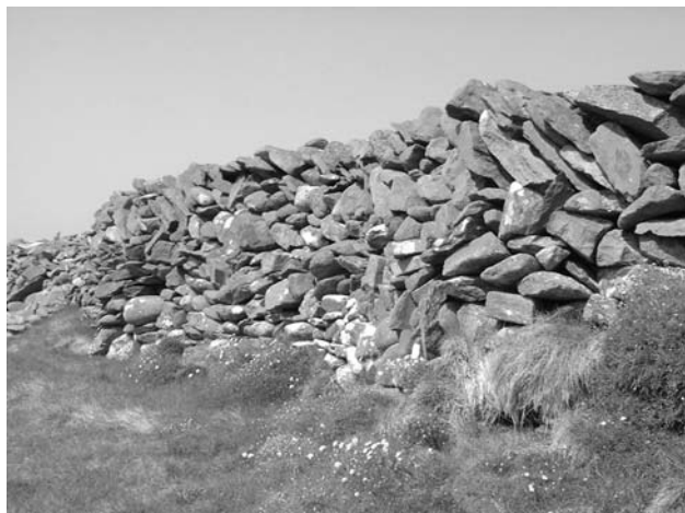
Coastal Stone Wall

References within BiblioMara are sorted in alphabetical order by the name of the first author and a unique citation number is assigned to each entry. Each reference contains information on reference type, authors, editors, and publisher and includes a short abstract describing the reference.