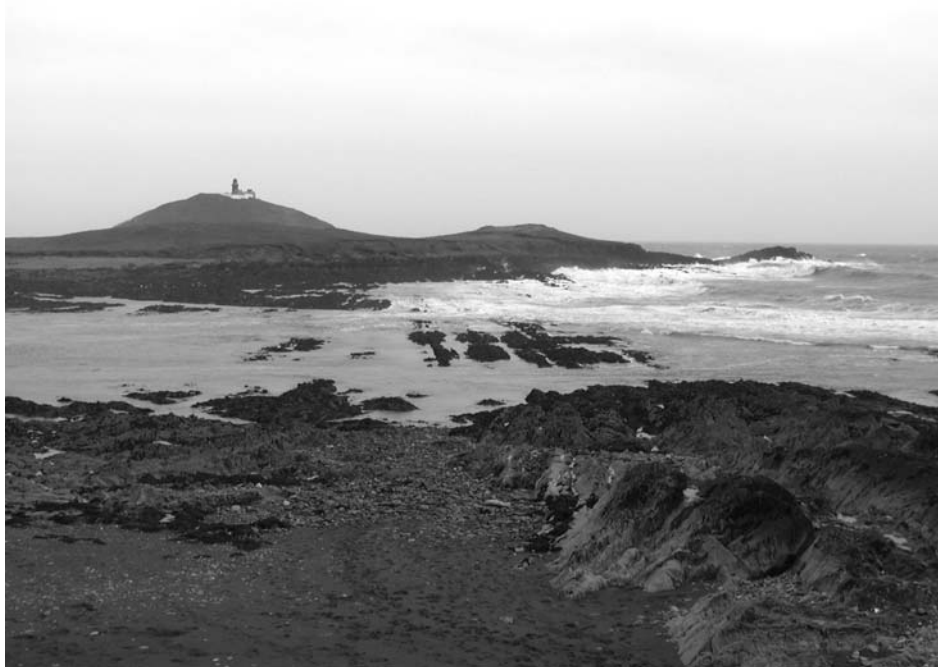
Ballycotton Lighthouse, Co. Cork