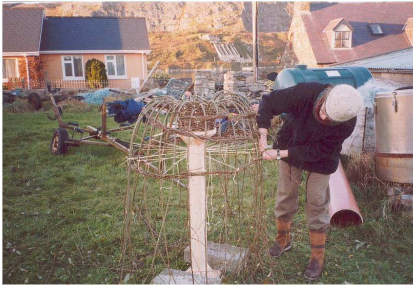
Cliona O'Carroll making a traditional lobster pot, West Cork, November 2003